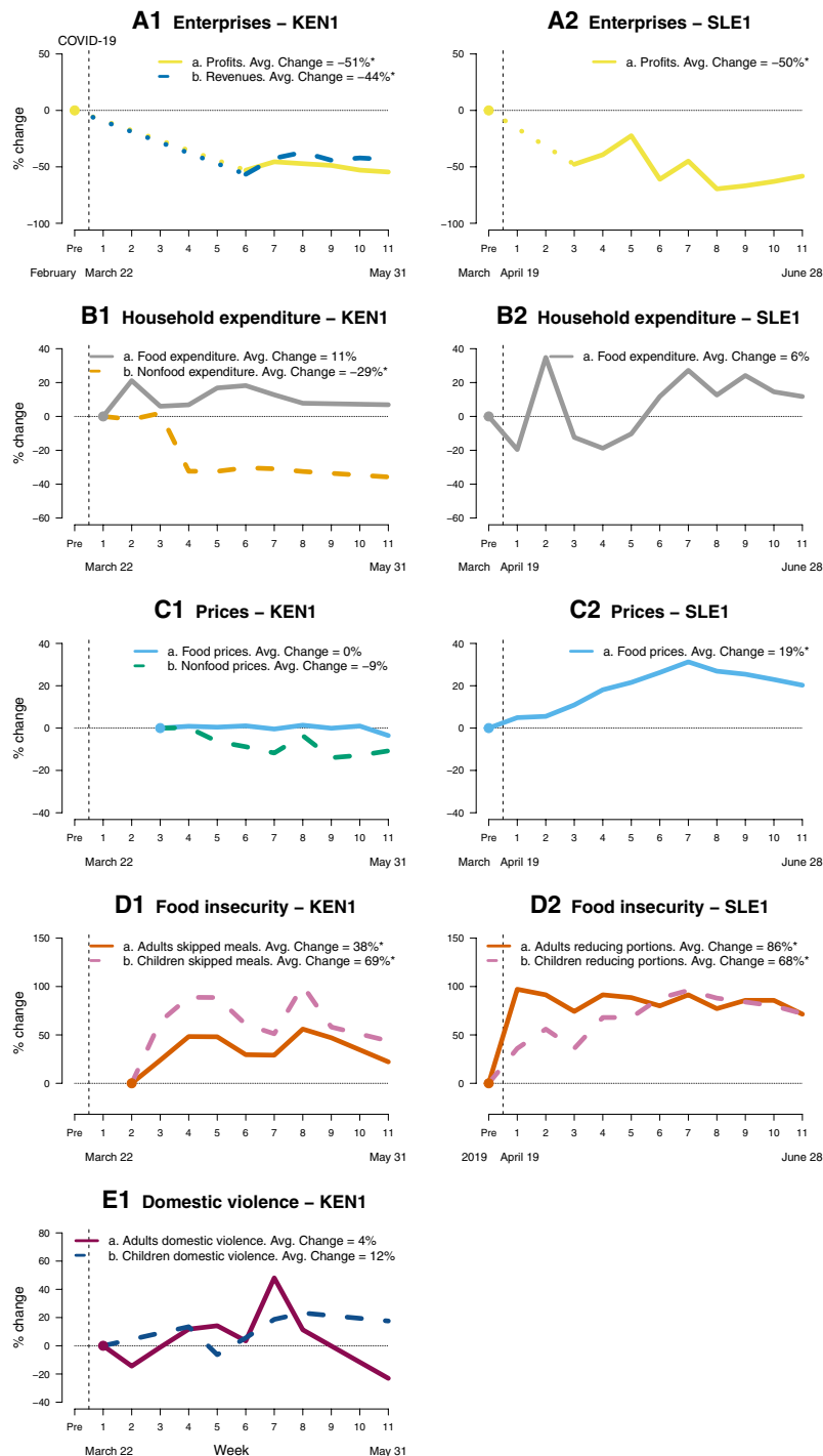
Fig. 1. Evolution of key indicators over time. This figure shows the percentage difference from baseline for several indicators in rural Kenya and Sierra Leone during the COVID-19 global pandemic relative to the pre-COVID-19 or early COVID-19 levels. The Kenya sample is representative of all households and enterprises across 653 rural villages in three subcounties taking part in an unconditional cash transfer program. The Sierra Leone sample is representative of households in 195 rural towns across all 12 districts of Sierra Leone. Surveys in Kenya were conducted in two rounds. During the first round (weeks 1 through 8), 8594 households were interviewed. During the second round (week 11), 1394 households were surveyed, of which 1123 were interviewed for a second time. Surveys in Sierra Leone were conducted across 2439 households. The pre-COVID-19 levels are from questions that recall data from February (A1) and March (A2 to C2) or from a previous survey conducted in November 2019 (D2). The post-COVID-19 levels are from questions that recall data from the prior 7 days (A to D2 and C to D1), prior 2 weeks (A1 and E1), and a combination (prior 7 days for food and prior 2 weeks for nonfood expenditures in B1). The weeks on the horizontal axis refer to the start of the recall period for each observation rather than the period during which the data were collected. The dotted lines in A1 and A2 show the linear trend from the pre-COVID baseline to the first observation for each respective time series. Baseline level for D1 is 1.3 days out of seven for adults and 0.72 for children. Baseline level for D2 is 35% of adults missing any meals in prior 7 days and 25% of children. Baseline level for E1 is 8% of adults experiencing violence in the prior 7 days and 20% of children. * P < 0.05 .